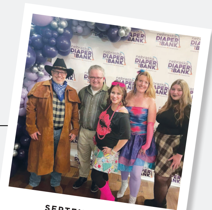
SEPTEMBER 2024 Core Bank employees attending the Nebraska Diaper Bank "Music To Their Rears" decades-themed dinner fundraiser